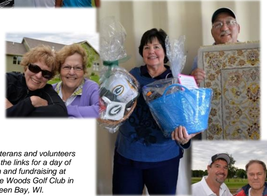
Veterans and volunteers hit the links for a day of fun and fundraising at The Woods Golf Club in Green Bay, WI.